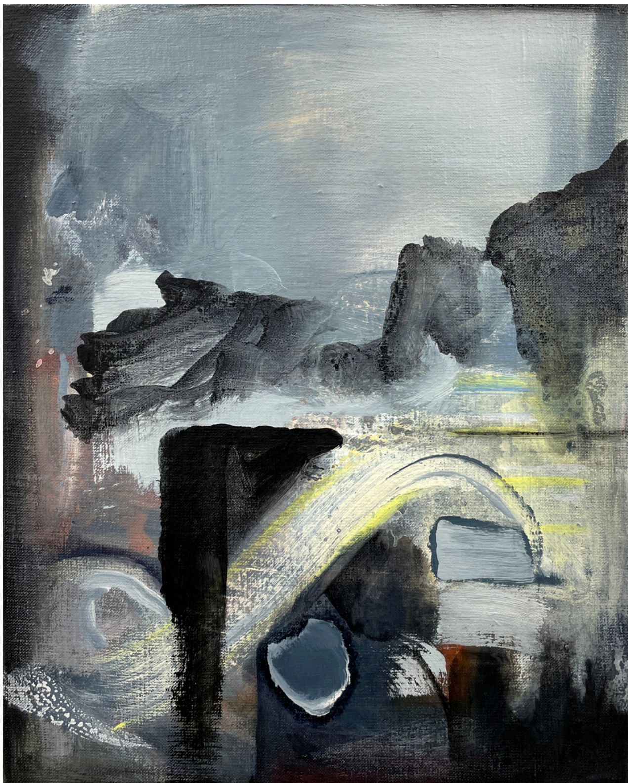
A Conjured Land, 2022