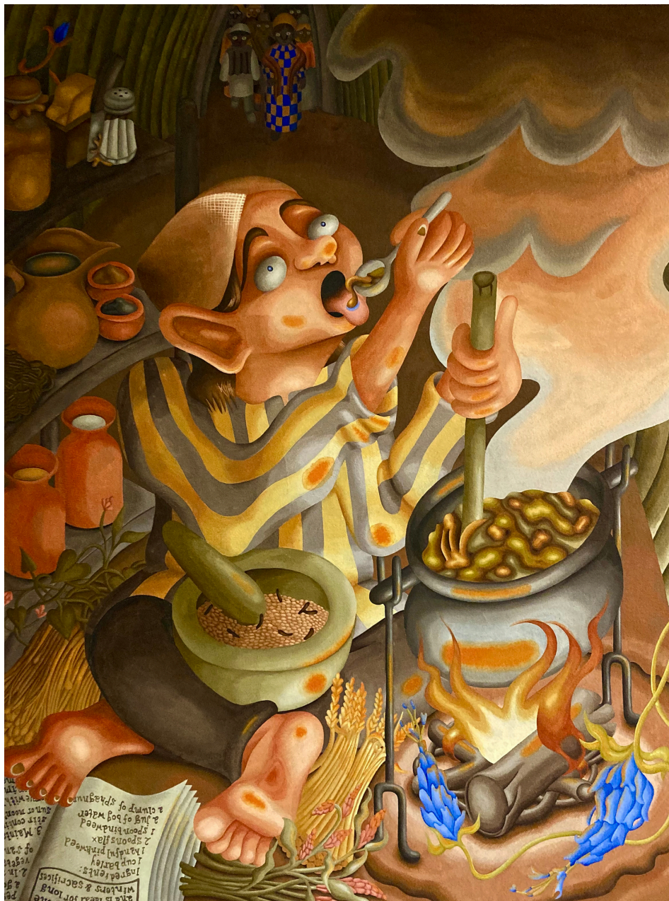
The Porridge Eater, 2023