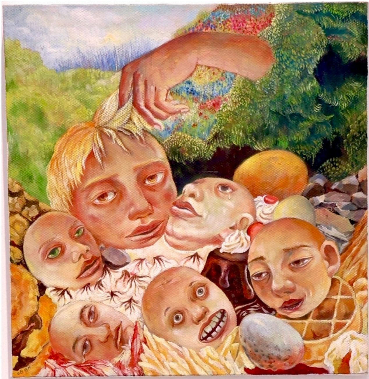
甜烦恼 Sweet Annoyance, 2019