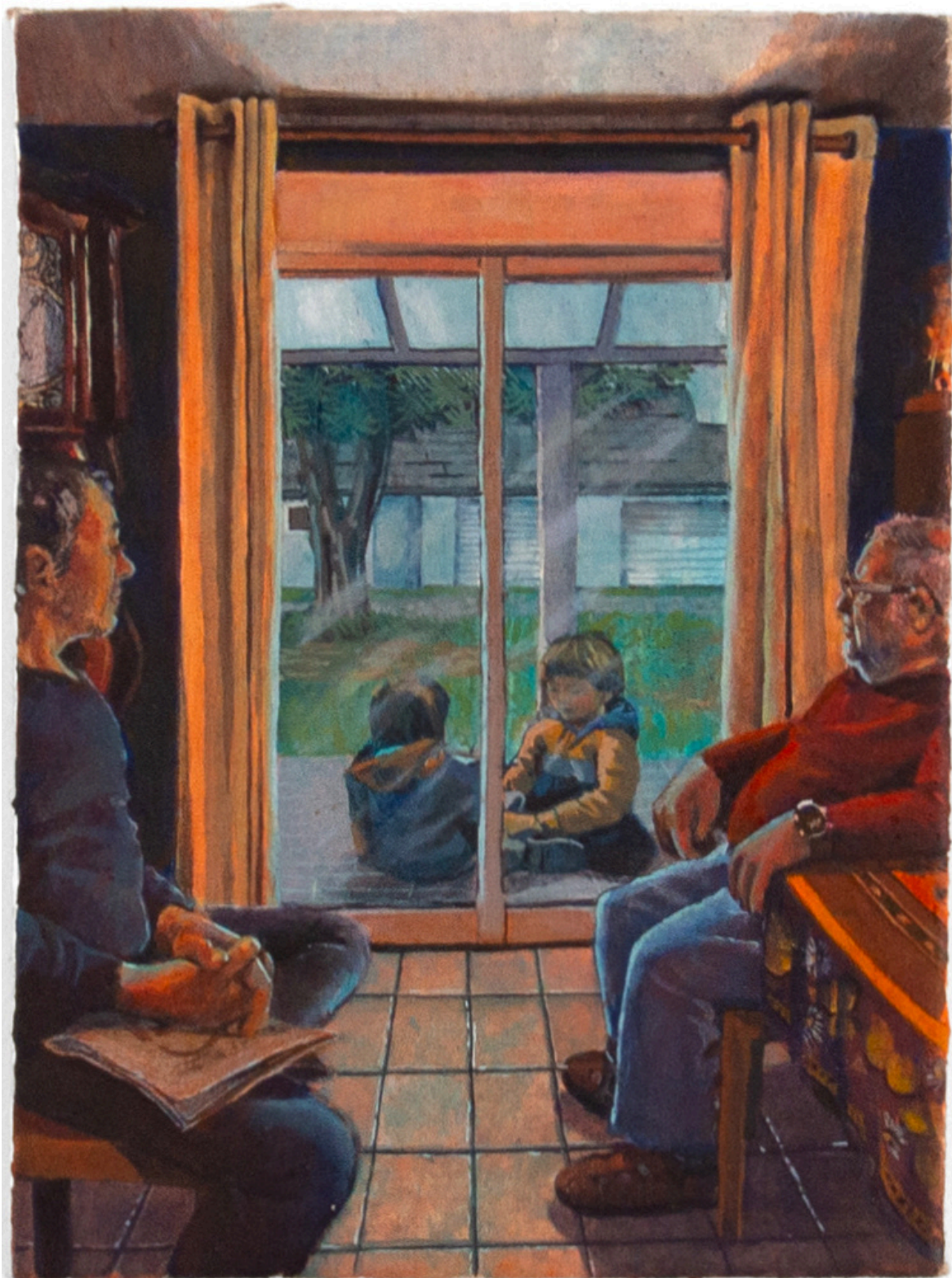
And their children after them, 2024