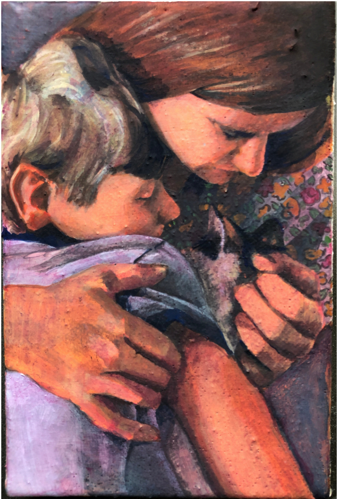
My brother, my mother, my cat, 2024