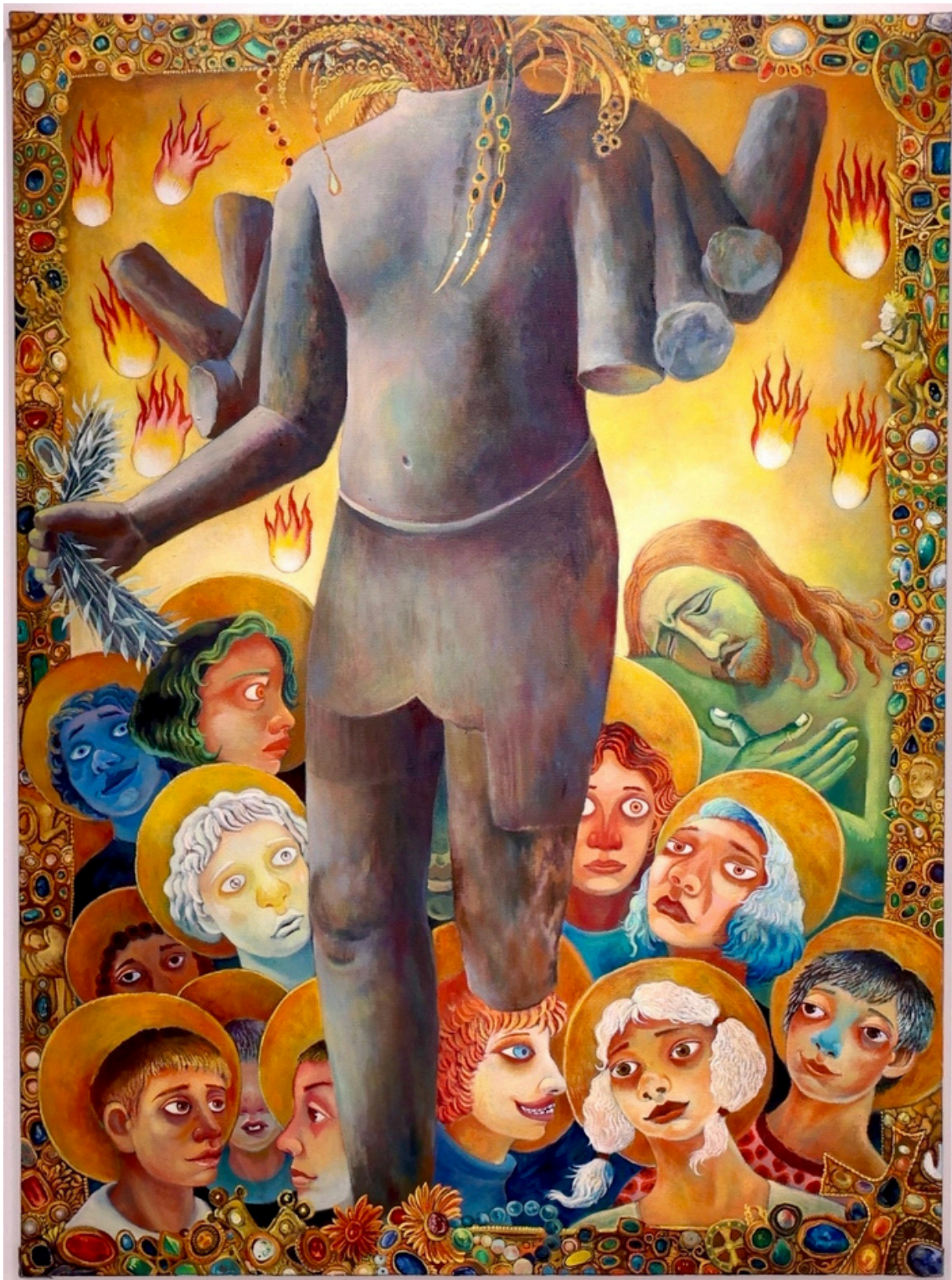
燃 Flame, 2023