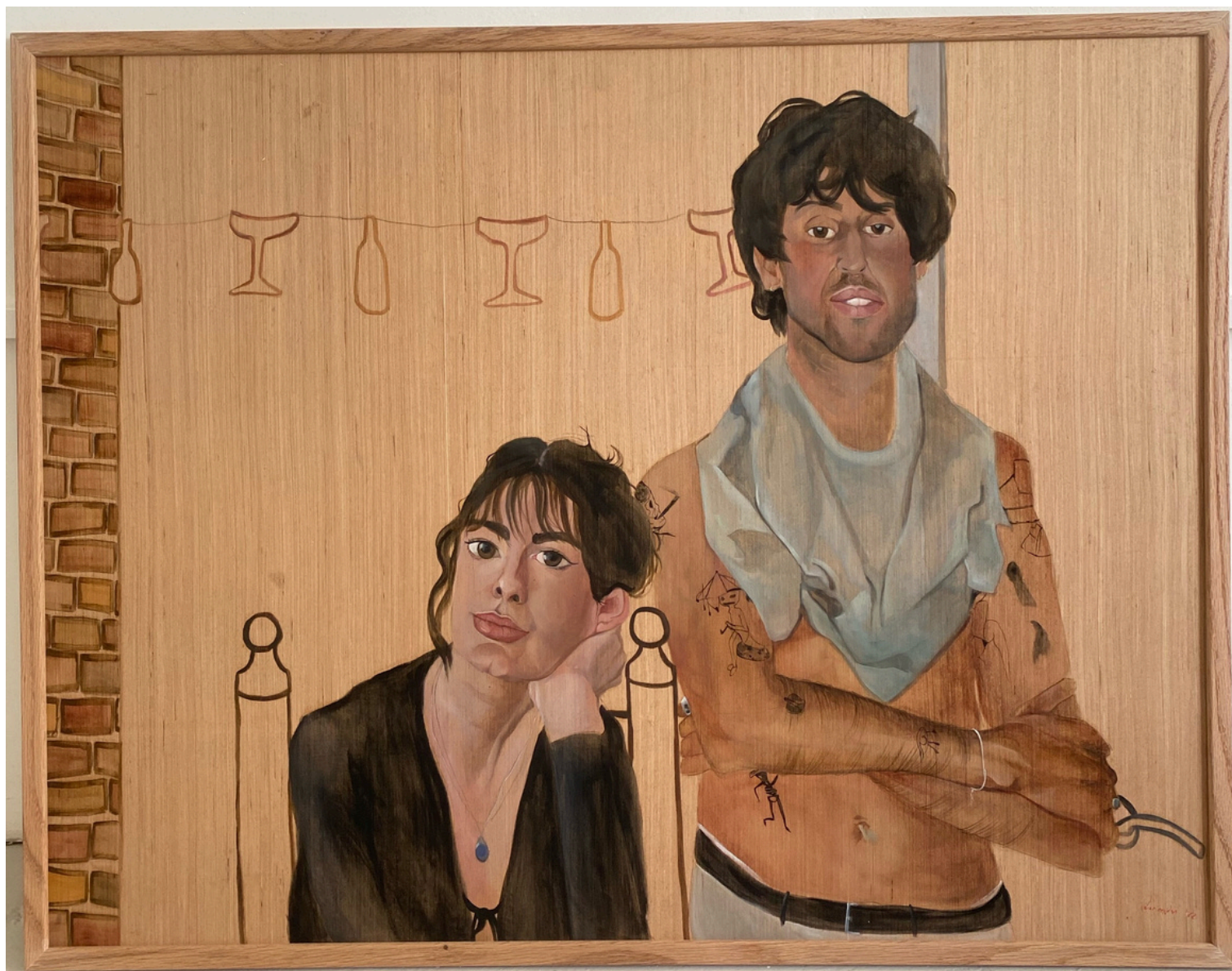
Brick and Bunting, 2023